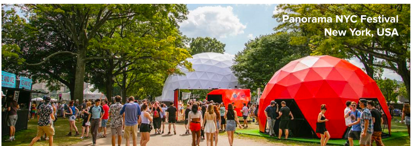
Panorama NYC Festival New York, USA