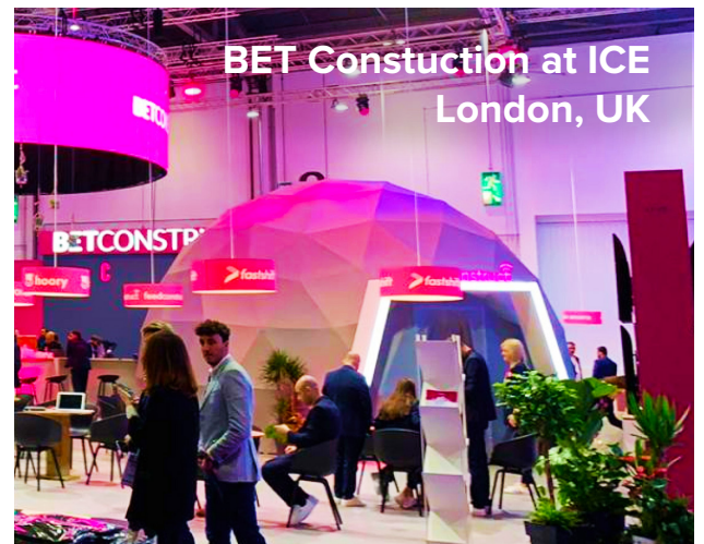
BET Constuction at ICE London, UK