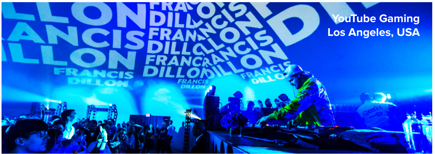
YouTube Gaming Los Angeles, USA