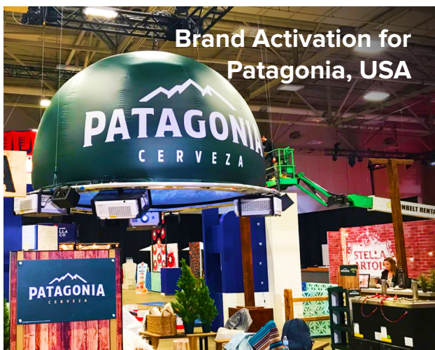
Brand Activation for Patagonia, USA