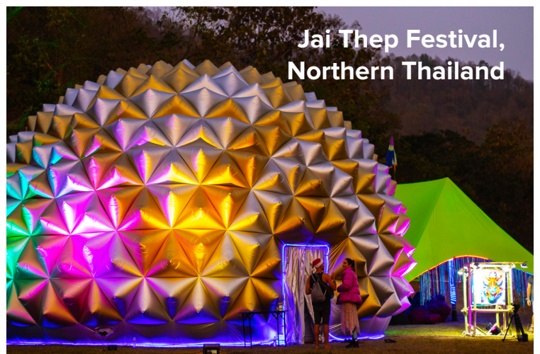
Jai Thep Festival, Northern Thailand