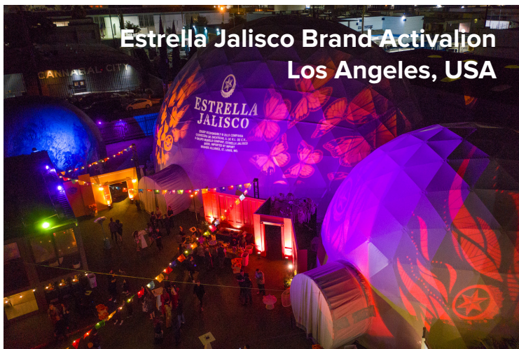
Estrella Jalisco Brand Activation Los Angeles, USA